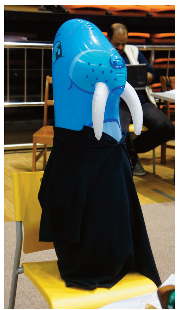
We were not told why, but the French Girls decided to employ a different mascotte during the second week.

The new USA Basketball 'dream team' had its first outing. They beat Sydney silver medallists France, a team with six NBA players, by 98-71.